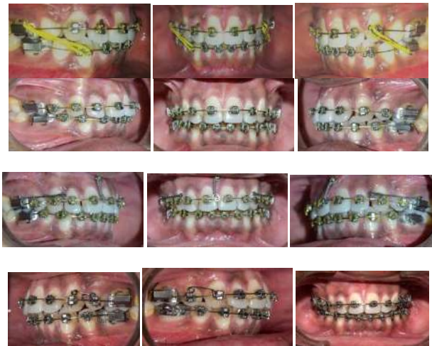
Figure 2- Mid treatment records.

arches by replacing the 0.017"X 0.025" SS wire along with uprighting spring to upright the rotated teeth (Figure 2). Complete occlusion settling could not be done as the patient wanted to have his brackets removed since he was relocating regarding his job. Hence an early debonding was done. Additionally, this patient had come to us with an excessive proclination which was corrected by extraction of first premolars followed by maximum retraction. On complete retraction we weren't left with more space to achieve the ideal proclination of upper incisor but we still managed to improve and achieve a good soft tissue profile. The patient was also very much satisfied with his treatment.