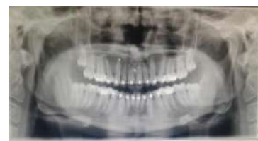
Fig 3-Mid treatment OPG of the patient.

Mid treatment patient's intra oral photograph showing class III elastics on right side and class II on left side, 0.017"x0.025" SS rectangular wire in upper and lower arch, Mid line implant along with class I force on both the sides (Biomechanics of intrusion uprighting springs in the upper arch premolar region placed bilaterally).